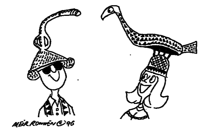
Illustrations of African headdresses.

In the Los Angeles market the staff also found Islamic skull caps and a style called the garison cap in the U.S. army. Both were made of the patterned, mud-dyed cloth